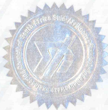
Chief Executive Officer